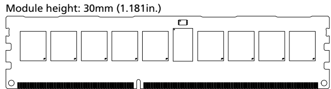
Figure 2: 240-Pin RDIMM (MO-269 R/C B1)