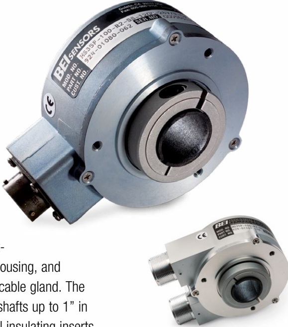
The HS35 Dual Output Encoder

The HS35 combines the rugged, heavy-duty features usually associated with shafted encoders into a hollow shaft style. Its design includes dual bearings and shaft seals for NEMA 4, 13 and IP65 environmental ratings, a rugged metal housing, and a sealed connector or cable gland. The HS35 accommodates shafts up to 1" in diameter. With optional insulating inserts, it can be mounted on smaller diameter shafts. It can be mounted on a through shaft or a blind shaft with a closed cover to maintain its environmental rating. The HS35 is also available with a dual output option (inset) to provide redundant encoder signals, dual resolutions, or to supply two separate controllers from a single encoder. Applications include motor feedback and vector control, printing industries, robotic control, oil service industries, and web process control.