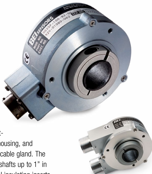
The HS35 Dual Output Encoder

The HS35 combines the rugged, heavy-duty features usually associated with shafted encoders into a hollow shaft style. Its design includes dual bearings and shaft seals for NEMA 4, 13 and IP65 environmental ratings, a rugged metal housing, and a sealed connector or cable gland. The HS35 accommodates shafts up to 1" in diameter. With optional insulating inserts, it can be mounted on smaller diameter shafts. It can be mounted on a through shaft or a blind shaft with a closed cover to maintain its environmental rating.