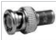
BNC Terminators 1/2 W @ 1%, with and without Grounding Strap