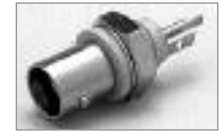
Isolated BNC (F) 3/8" Chassis Mount Hole