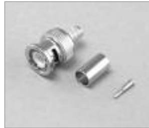
Crimp BNC (M) 3 Piece