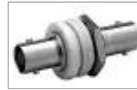
Isolated Dual BNC (F) 1/2" & 5/8" Chassis Mount Hole