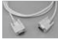
VGA/SVGA Multi-Coax Monitor Cable