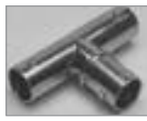
BNC 'T' Adapter 3 Female (F-F-F)