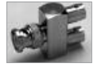
BNC Goalpost 'T' Adapter 1 Male - 2 Female (F-M-F)