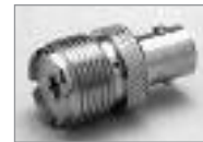
BNC (F) to UHF (F)