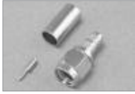
SMA for Flexible Cable (M) Crimp, 3 Piece, Solder or Crimp Center Pin