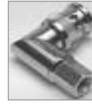
Right Angle, Twist-On BNC (M) 1 Piece, Solderless