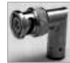
Right Angle BNC (F) to BNC (M)