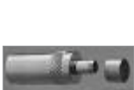
Push-On F-59PG (M) or RG-59 Cable with Center Pin.