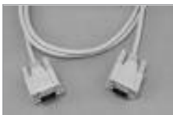
DB9 Data Switch Cable Wired Pin to Pin