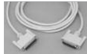
DB25 Data Switch Cable 25 Conductor, 28 AWG, Shielded