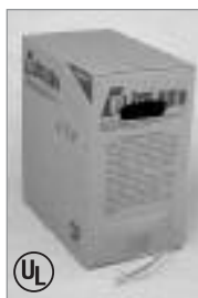
Cat5E & Cat6 Stranded Patch Cable 4 pair, 24 AWG Unshielded, EIA/TIA 568, 1,000 ft. "Reel in Box" with cable length markings.