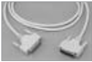
Serial & Parallel Extension Cable 25 Conductor, 28 AWG, Shielded