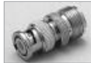
BNC (M) to UHF (F)