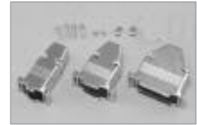
Shielded Metal 'HM' Series D-Sub Hoods includes Hardware, Silver.