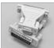
Gender Adapter DB9 (F) to DB25 (M)