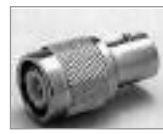
BNC (F) to TNC (M)