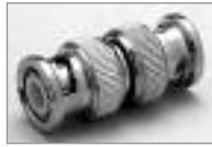
BNC (M) to BNC (M)