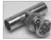
BNC 'T' Adapter 1 Male - 2 Female (F-M-F), UG-274/U