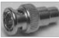
BNC (M) to RCA (F)