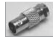
BNC (F) to 'F' (M)