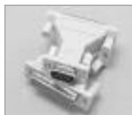
Gender Adapter DB9 (M) to DB25 (F)