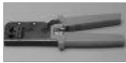
Modular Crimping Tool that cuts, strips and terminates 2, 4, 6, 8, & 8 Keyed Modular Plugs. (Will not work on AMP™ RJ-45 Plugs.)

Non-Ratchet No. 24-4680P w/ Ratchet No. 24-4680RP