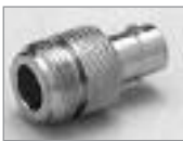
'N' (F) to BNC (F) UG-606/U