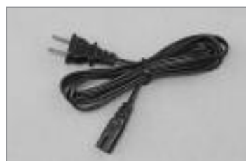
Panasonic Replacement AC Power Cords, 6 ft.