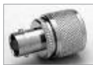
UG-273/U Adapter UHF (M) to BNC (F)