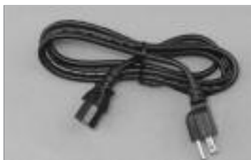
Three Conductor Electrical Equipment Cords Use with Computer Monitors, Printers, Peripheral Devices & other Electronic Equipment, 7 Amp 125 V, 18 AWG.