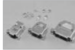
Deluxe Metalized 'HS' Series D-Sub Hoods includes Mounting Hardware, Shield Coating, Silver.