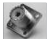
Chassis Mount UHF (F) to Solder Lug, SO-239