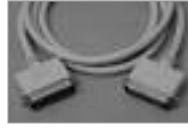
Centronics Printer Cable 36 Conductor, 28 AWG, Shielded