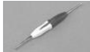
High-Density D-Sub Insertion & Extraction Tool