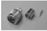
Crimp 'N' (M) 3 Piece, Crimp Center Pin