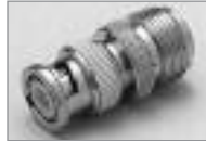
UG-255 Adapter UHF (F) to BNC (M)