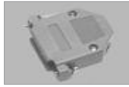
Deluxe Plastic 'HX' Series D-Sub Hoods includes Mounting Hardware & Set Screw to Hold Cable, Gray.