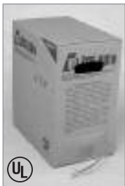
Cat5E & Cat6 Stranded Patch Cable 4 pair, 24 AWG Unshielded, EIA/TIA 568, 1,000 ft. "Reel in Box" with cable length markings.