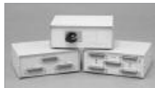
D-Sub Manual Data Switches Rotary Switch, 2-amp capacity, No AC Required, Boxed, Metal