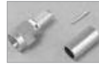
SMA (M) Crimp, 3 Piece, Solder or Crimp Center Pin