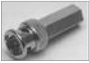
Twist-On BNC (M) Piece, Crimpless & Solderless