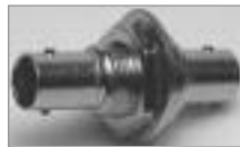
Dual BNC (F) 1/2" Chassis Mount Hole, UG-492