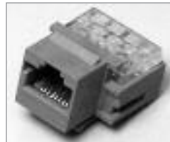
90° Cat3 Tool-less Keystone USOC Jacks (Voice - 6p6c)