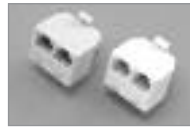
Unshielded Modular Duplex Adapter for splitting Voice, Modem, Fax and Data Lines.