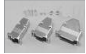
Shielded Metal 'HM' Series D-Sub Hoods includes Hardware, Silver.