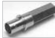
Twist-On BNC Jack (F) 1 Piece, Field Installable