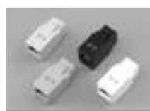
Unshielded Cat 5e RJ-45 Keystone Feed Through Adapter