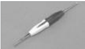
Standard D-Sub Insertion & Extraction Tool