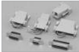
Color: Gray Built to USOC Color Code