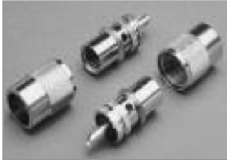
UHF (M) Solder, 2 Piece, PL-259