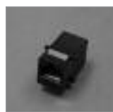
Unshielded Cat 4 RJ-45 Keystone Feed Through Adapter Black