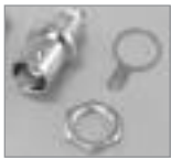
Solder to BNC (F) 3/8" Mounting Hole, UG-1094U