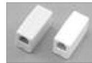
Unshielded Modular In-Line Coupler Wired Straight for Data Applications.