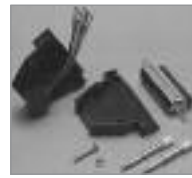
Color: Black Built to Nevada Western Color Code