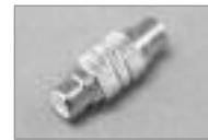
Inline Adapter, Metal RCA (F) to RCA (F) Gold Plated