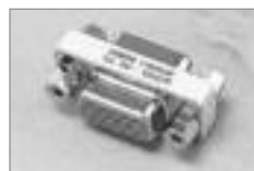
High Density D-Sub (SVGA) Mini Gender Changers & Port Saver