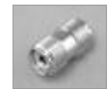
UHF (F) to 'F' (M)