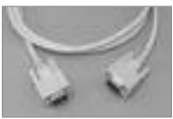
VGA/SVGA Multi-Conductor Video Cable