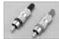
RCA Plug (M) Metal