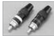
RCA Plug (M) Gold Plated