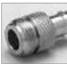
'N' (F) to BNC (F) UG-606/U