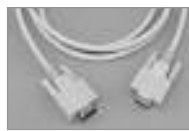
VGA/SVGA Multi-Conductor Extension Cable