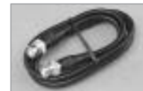
BNC Cable Assemblies Shielded BNC (M) to BNC (M), Black