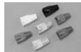
Colored Snagless Boots for RJ-45 8 Conductor Shielded and Unshielded Modular Plugs.