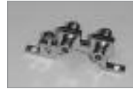
CATV F-81 Grounding Blocks Zinc diecast, includes 2 mounting screws.