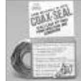
COAX Seal 1/2" x 60" Moldable plastic. Seals fittings from moisture, Sold in 12 packs