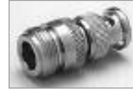
'N' (F) to BNC (M) UG-349/U