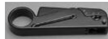
2-Step Cable Stripper with non-adjustable replacement blades RG-8, 11 & 213.