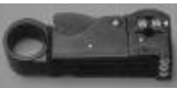
3-Step Cable Stripper with adjustable replacement blades for standard & Teflon RG-58, 59 & 62.