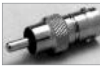
BNC (F) to RCA (M)