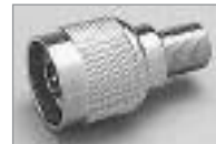
'N' (M) to 'F' (F)