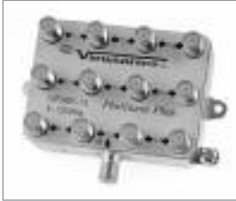
CATV Platinum Plus Splitter Vertical, 5 MHz to 1 GHz

Features solder sealed back plate providing 130db RF shielding, a printed circuit design that ensures performance up to 1 GHz, and a specially plated Zinc housing allows for excellent corrosion resistance. Port spacing allows for easy installation of security shields, and each comes complete with a grounding screw.