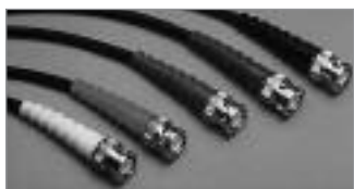
RG-58 Thin Ethernet BNC to BNC Cables Constructed of 50 Ohm, 95% Braid & 100% Foil Shield Cable, 20 AWG Stranded (Belden 9907 Equivalent), Black PVC Cable.