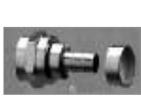
Crimp-On F-59 (M) with Separate 1/8" Ring.

(Use 24-7710 or 24-8866P for the following connectors)