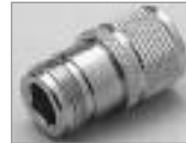
'N' (F) to UHF (M) UG-83/U