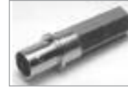
Twist-On BNC (F) 1 Piece, UG-89