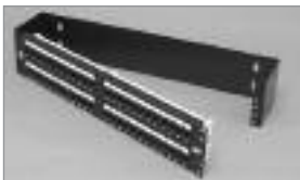
Hinged Wallmount Patch Panel Bracket 5" depth, EIA/TIA Threaded Hole Pattern, Metal, Black