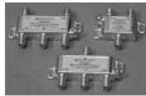
CATV Digital Ready Splitters Horizontal, 5 MHz to 1 GHz

Features solder sealed back plate providing 130db RF shielding, a printed circuit design that ensures performance up to 1 GHz, and a specially plated Zinc housing and 360° port sealing sleeves allow for excellent corrosion resistance. Port spacing allows for easy installation of security shields, and each comes complete with a grounding screw.