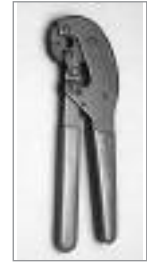
'F' Deluxe Hex Crimp Tool for RG-6 & 59.