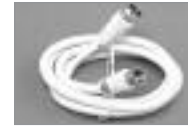
RG-59 Hook-up Cables with Molded Strain Relief 75 Ohm, Packaged for Retail Display.