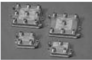
CATV Digital Ready Splitters Vertical, 5 MHz to 1 GHz

Features solder sealed back plate providing 130db RF shielding, a printed circuit design that ensures performance up to 1 GHz, and a specially plated Zinc housing and 360° port sealing sleeves allow for excellent corrosion resistance. Port spacing allows for easy installation of security shields, and each comes complete with a grounding screw.