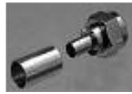
Crimp-On F-59 (M) with Separate 1/2" Ring.