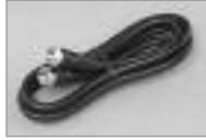
F-59 Hook-Up Cable with Molded Strain Relief 75 Ohm, Bulk Packaged.