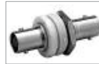
Isolated Dual BNC (F) 1/2" & 5/8" Chassis Mount Hole