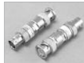
BNC (M) to BNC (F) Attenuator Pads 1/2 W @ 5%, 50 Ohms