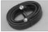
F-59 Hook-Up Cable with Gold Connectors Molded Strain Relief, 75 Ohm, Packaged for Retail Display.