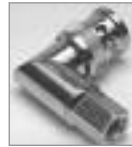
Right Angle, Twist-On BNC (M) 1 Piece, Crimpless & Solderless