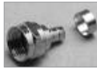
Crimp-On Gold Plated F-59 (M) with Separate 1/8" Ring.