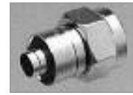
Crimp-On F-59A (M) with Attached 1/8" Ring.