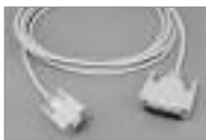
External Serial Modem Cable