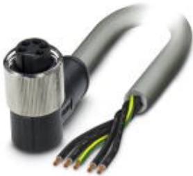
Power cable, 5-pos., gray PUR/PVC, 2.5 mm 2 , free cable end to angled 7/8" 16UNF socket, length: 1.5 m

Please be informed that the data shown in this PDF Document is generated from our Online Catalog. Please find the complete data in the user's documentation. Our General Terms of Use for Downloads are valid ( http://download.phoenixcontact.com )