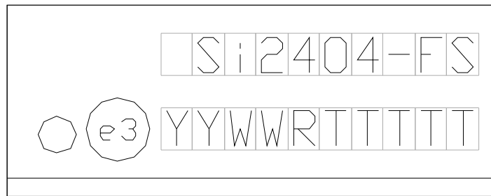
Figure 18. Si2404-D-FS Top Marking