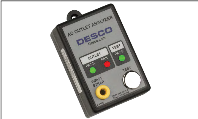
Figure 1. Desco 98132 AC Outlet Analyzer and Wrist Strap Tester