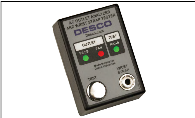
Figure 2. Desco 98131 AC Outlet Analyzer and Wrist Strap Tester