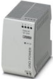
Primary-switched UNO power supply for DIN rail mounting, input: single-phase, output: 12 V DC/100 W

Please be informed that the data shown in this PDF Document is generated from our Online Catalog. Please find the complete data in the user's documentation. Our General Terms of Use for Downloads are valid ( http://phoenixcontact.com/download )