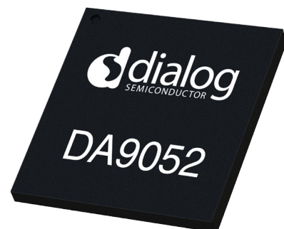
VFBGA 7 mm x 7 mm, 0.5 mm pitch package

An integrated 10-channel general purpose ADC includes support for a touch screen controller with pen down detect, programmable high/low thresholds, an integrated current source for resistive measurements, and system voltage monitoring with a programmable low voltage warning. The ADC has 8-bit resolution in auto mode and 10-bit resolution in manual conversion mode.