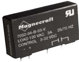
70S2 V (3 Amp)