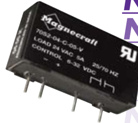
70S2 V (5 Amp)