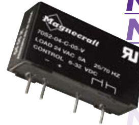
70S2 V (5 Amp)