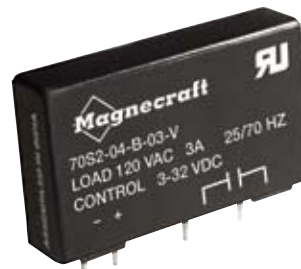
70S2 V (3 Amp)