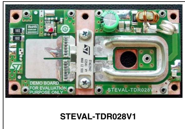
Table 1. Device summary

The STEVAL-TDR028V1 is designed in cooperation with InnovAction S.r.l in Italy.