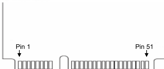
Figure 1-2 Pin Assignment

Pin assignment of the SM220-300B is shown in Figure 1-2 and described in Table 1-3.