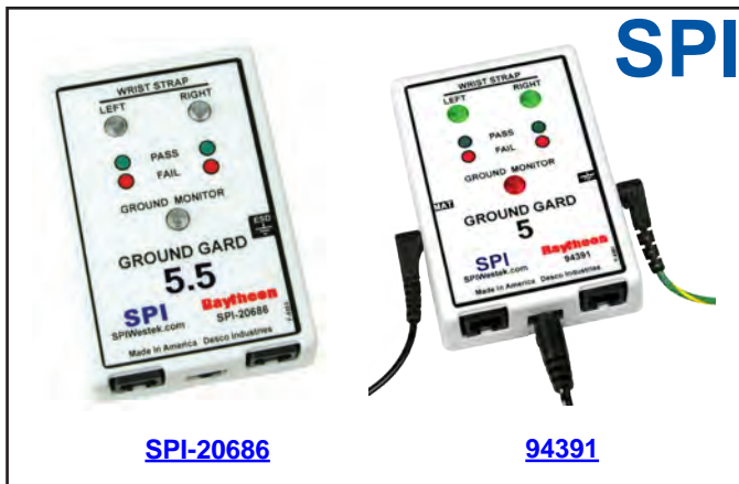
Figure 1. SPI Ground Gard items SPI-20686 and 94391