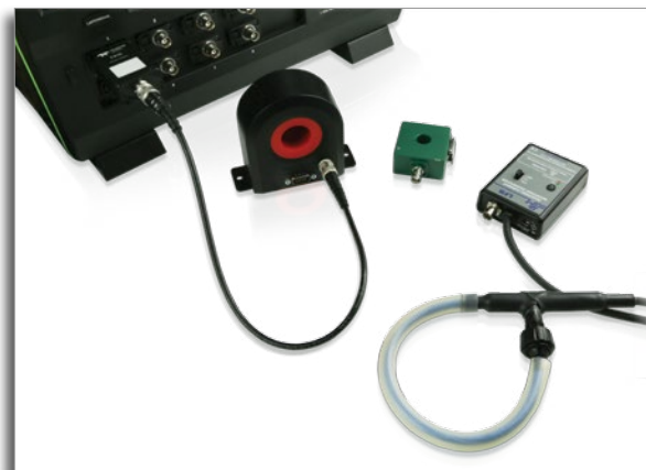
CA10 ProBus current adapter attached to a Danisense Current Transducer. Also shown is a Pearson Current Transformer and a PEM-UK Rogowski Coil, which are also third party devices that can be used with the CA10.