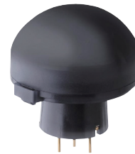
Long distance detection type