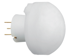
Wall installation type