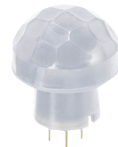
10m detection type