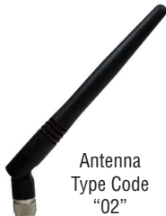
Antenna Type Code "02"

WAN01RSP straight design, 2.2 dBi gain, direct mount connector