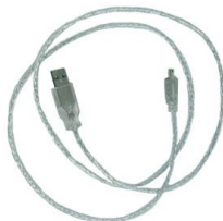
Figure 7: EXTMUSB3FT

An External Mini-B USB Cable may also be used to access data within the onboard SD card when removing the card itself is not possible. This connection also provides power to the GTT and can be more convenient than moving the SD card from one location to another.