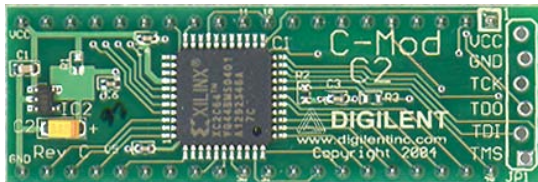
The Cmod board.

Cmod boards combine a Xilinx CPLD, a JTAG programming port, and power supply circuits in a convenient 600-mil, 40-pin DIP package. Cmods are ideally suited for breadboard or other prototype circuit designs where the use of small surface mount packages is impractical. All Cmod boards include: