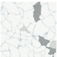
Gray 8413 (S.D.) or 8433 (Cond.)