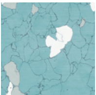
Reverse Green 8425 (S.D.) or 8445 (Cond.)