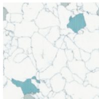
Green 8415 (S.D.) or 8435 (Cond.)