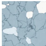
Reverse Blue 8424 (S.D.) or 8444 (Cond.)