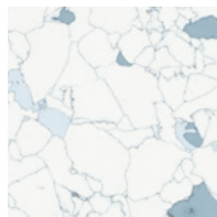
Blue 8414 (S.D.) or 8434 (Cond.)