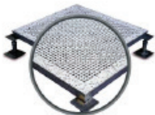
3M™ Static Control Vinyl Floor Tile 8400 Series is available in the special 24.5" x 24.5" size used for raised access floor panels.