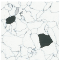
Black 8417 (S.D.) or 8437 (Cond.)