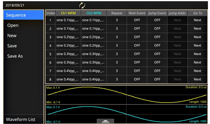
Advanced mode lets you build complex waveform sequences with flexible step controls

This feature is very useful in applications where many test cases need to be performed sequentially. Instead of loading the test cases one by one, you can put all of them in a sequence and load at one time, switching from one to another seamlessly to greatly improve the test efficiency.