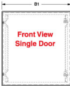
Front View Single Door