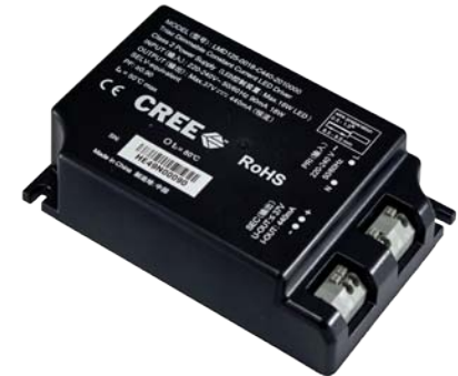
230 V Driver