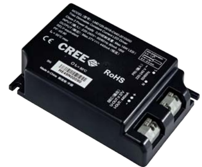
230 V Driver