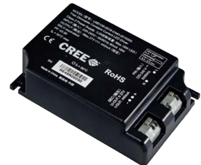
230 V Driver