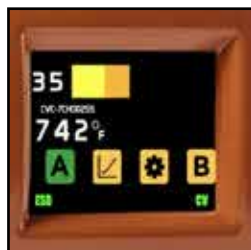
Tip temperature displayed on large color screen.