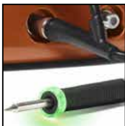
LED equipped hand piece signals to operator when a good solder joint is formed.