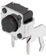
LPV: Through hole, angled