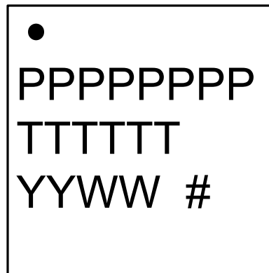
Figure 7.3. Package Marking