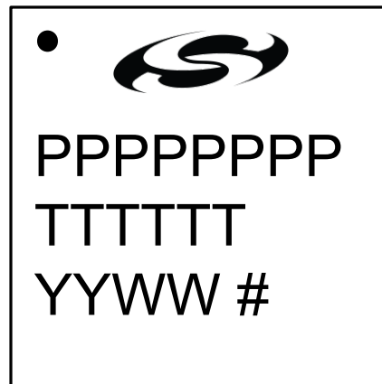
Figure 6.3. QFN28 Package Marking