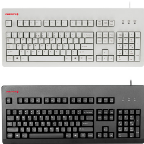
Models may vary from the image shown