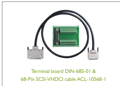
Terminal board DIN-68S-01 & 68-Pin SCSI-VHDCI cable ACL-10568-1

* For more information on mating cables, please refer to P2-61/62.