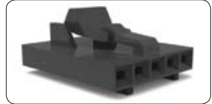
AMPMODU MTE Housing