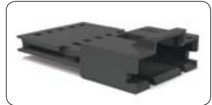
AMPMODU MTE Housing