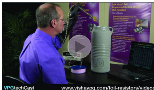
FIGURE 7 - PRECISION RESISTOR IN CRYOGENIC CONDITIONS - ONLY 5 PPM/°C (PRODUCT DEMO)

Different expansion/contraction rates of composite materials in resistors may induce discontinuities during temperature excursions that are not evident at temperature extremes, making an unreliable resistor appear normal. A good resistor must also return to its initial value with no resistance drift. In this demo, a VFR VSMP0805 precision resistor is monitored through the range of +25°C, down to -196°C and back up to +25°C. Results confirm the VSMP0805 exhibits only 5 ppm/°C TCR, experiences no discontinuities, and returns to its exact same starting value, showing absolutely no change in resistance (< 1 ppm measurement accuracy).