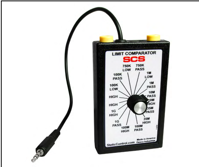
Figure 1. SCS 770751 Limit Comparator