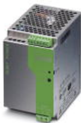
DIN rail power supply unit, primary-switched mode, 1-phase, output: 12 V DC / 10 A

Please be informed that the data shown in this PDF Document is generated from our Online Catalog. Please find the complete data in the user's documentation. Our General Terms of Use for Downloads are valid ( http://phoenixcontact.com/download )