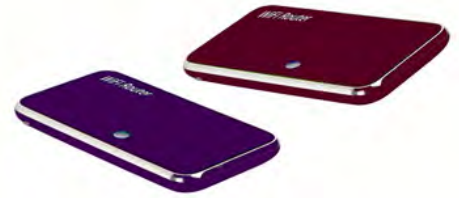
Mobile Wi-Fi* devices