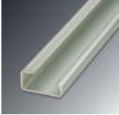
G rail 32 mm (NS 32)

DIN rail - NS 32 AL UNPERF 2000MM - 1201028