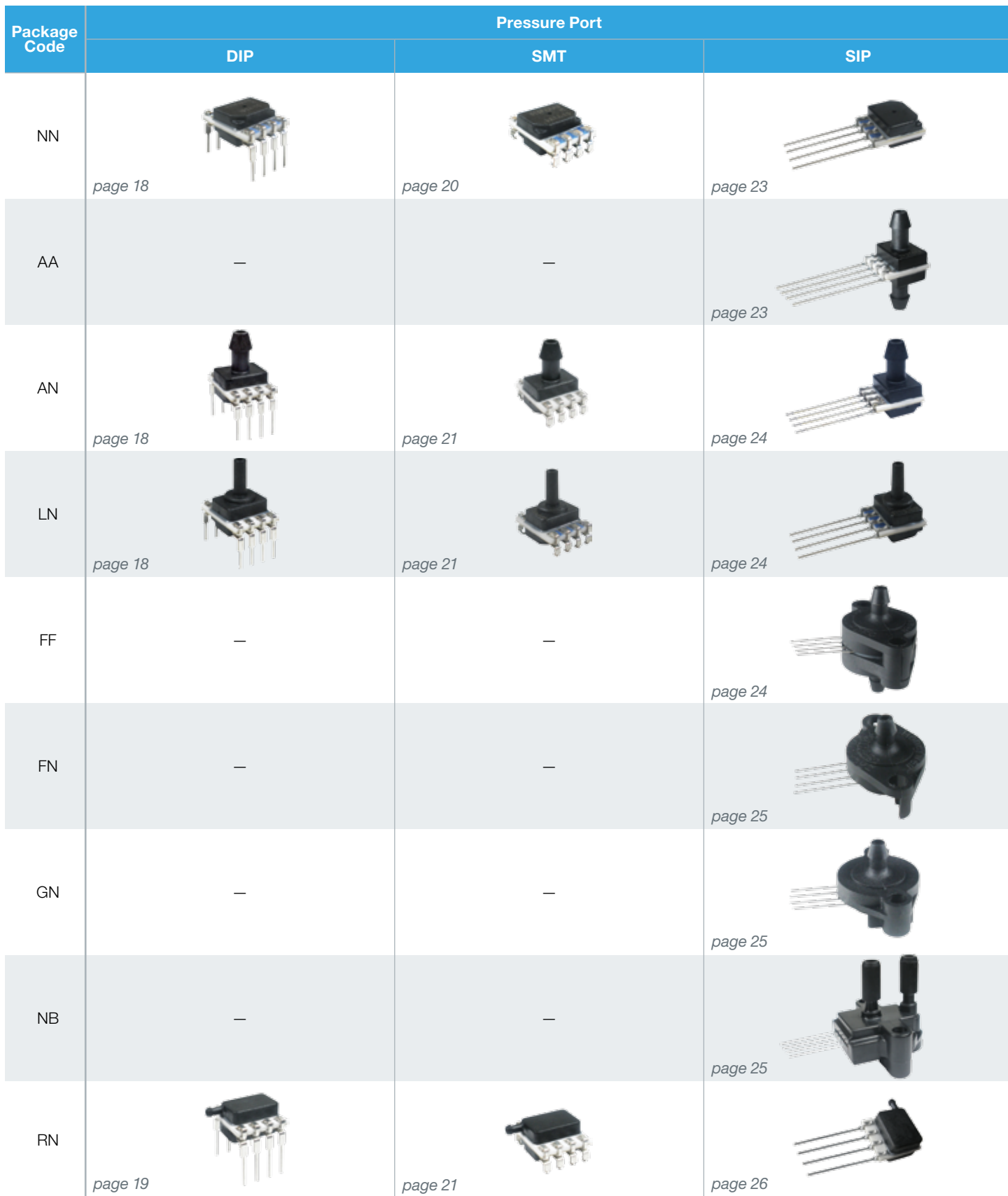
Figure 4. All Available Standard Configurations (Dimensional drawings on pages noted below.)