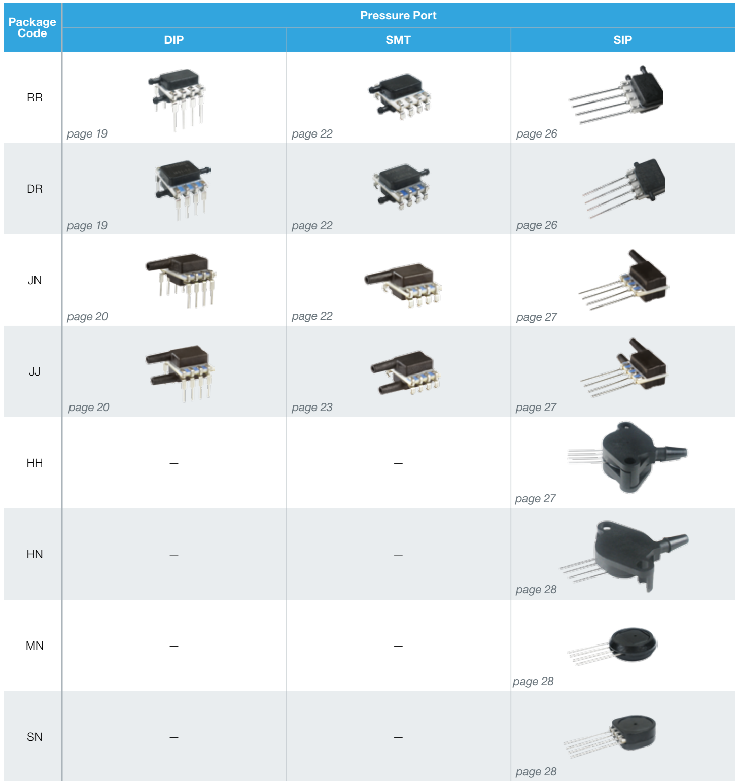
Figure 4. All Available Standard Configurations (Continued; dimensional drawings on pages noted below.)