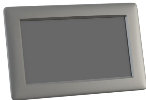
uLCD-70DT Mounted in 7.0" Bezel - Front