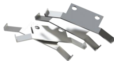
Type 2 Spring Clips