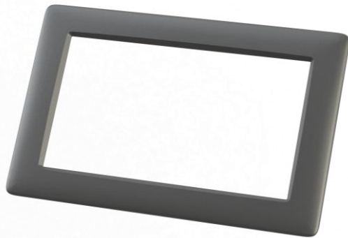
Bare 7.0" Bezel - Front