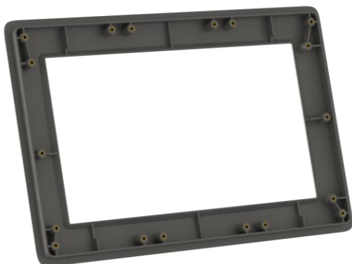
Bare 7.0" Bezel - Back