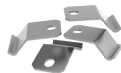
Type 1 Spring Clips