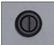
Standard Slotted Latch